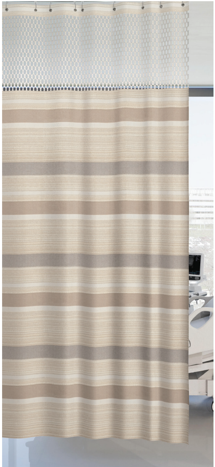
Shown: AC-33350 Grain #1